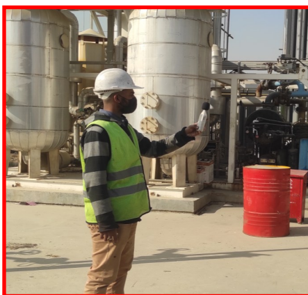
Noise Monitoring in Plant