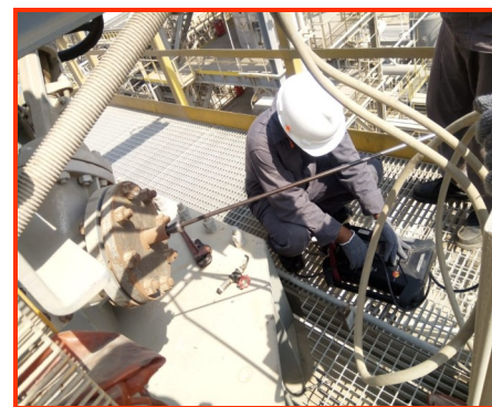
Stack Emission Testing