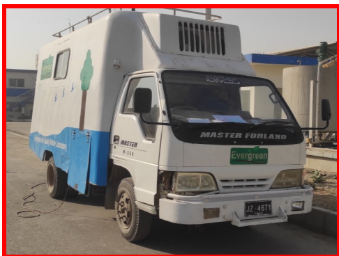
Ambient Air Monitoring