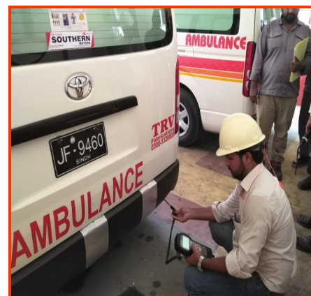
Vehicle Emission Monitoring