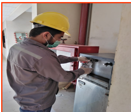
Drinking Water Sampling