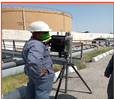
Fugitive Emission Testing